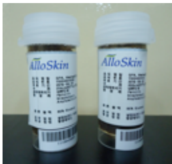
Figure 1. Bottled

We have very limited supply of skin allograft donated from Hallym Hospital Korea that we utilize only for indicated patients, patients with high risk of infection, major burned patients with more than 50 percent or more body surface areas wound. We have 4 patients to observe, 2 patients treated with early excision and skin allograft, 2 patients treated conservatively. We compare the clinical