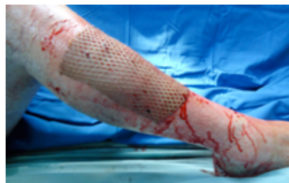
Figure 3. Example of Wound Covered by Skin