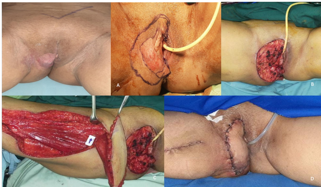
Figure 1. A 67-years old woman with basaloid squamous cell carcinoma vulva dextra (A); Unilateral vulvar (dextra) and perineum defect (B); Design and Harvesting Gracilis Myocutaneous Flap (C); Day 5 Post Operative Unilateral gracillis myocutaneous flap dextra (D)

Poor Perfusion/Ischemia - Healing wounds have an increased demand for oxygen and other factors to promote proper repair. Wounds with poor perfusion or ischemia do not receive sufficient blood flow to meet demand and are unable to heal correctly. Patient comorbidities, including vascular disease or venous insufficiency, increases patient risk for wound failure and dehiscence. Careful suturing can reduce local ischemia to the wound, preventing local wound failure. 3,4,5