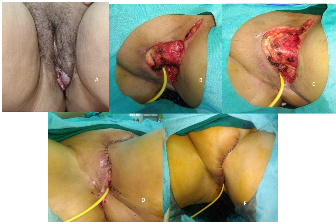
Figure 3. A 47-years-old woman with carcinoma cervix residif (a large defect) (A, B); Post operative rotation flap (C).

Two weeks after surgery, patient came with dehiscence in bilateral vulva and performed revision with another keystone flap from left side (Fig 2E and 2F). One month after surgery, there is no complication, with normal micturition and flap is in good condition (Fig 2G).