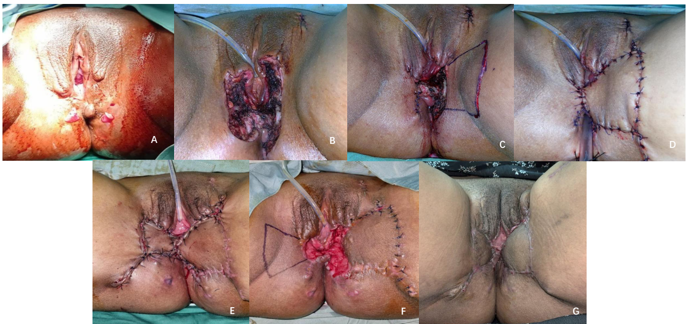
Figure 2. A 29-years-old woman with adenocarcinoma labia majora sinistra post radical vulvectomy (A); Bilateral of vulvar, a half of labia minora, left side of anal mucosa, and perineum (B); Right defect was primary suture (C); Design and Immediate pos op keystone flap in bilateral of vulvar, a half of labia minora, left side of anal mucosa, and perineum (D); Wound Dehiscence after 2 weeks post operative (E); Post operative another keystone flap at the right side (F); One month follow up after surgery (G).

To achieve primary wound healing and restore urogenital and anorectal function, the location of the defect and the presence of pelvic dead space should dictate the flap(s) selected. 2 In this case, we report a case series of genitalia defect cancer over a period of 5 years. This article report the demographic data, diagnosis, choice of flap reconstruction, functional and anatomical long term evaluation.