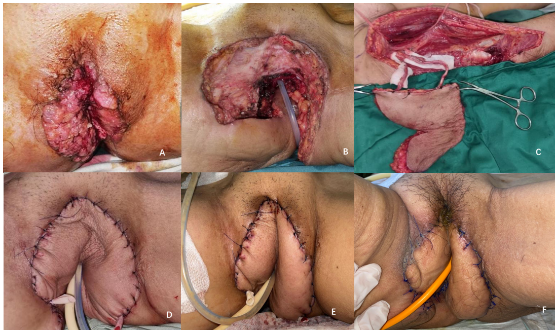
Figure 5. A 58-years-old woman with carcinoma vulva, with ALT flap (A); Defect after radical vulvectomy (B); Harvesting pedicled ALT flap (C); ALT flap in setting (D); One week after surgery (E); One month after surgery (F).

The gracilis flap can be rotated either anteriorly or posteriorly within a wide arc of rotation, allowing the flap to be inset for anterior vulvar or groin reconstruction, neovaginal formation, and repair off (fig 4C). Posterior vulvar and perineal defects. The arc of rotation of the classic flap is around the mobilized dominant vascular pedicle, while the short flap is rotated around the origin of the muscle from the pubic tubercle.