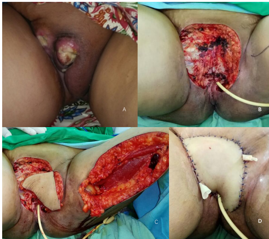
Figure 4. A 54-years-old woman with ca vulva post radical vulvectomy (A); Design and bilateral vulvar, urethra and perineal area (without anus mucosa) (B); Harvesting Gracilis Myocutaneous Flap and interpolate to defect (C); Post operative Gracillis Myocutaneous Flap (D).